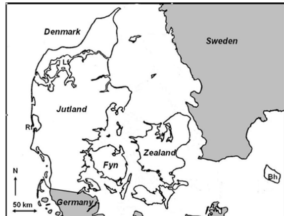
Figure 1. Study area of Denmark with its three main regions; Jutland, Zealand, and Fyn. Invertebrate and macroalgal samples were collected throughout Danish waters from east of Bornholm (Bh) to west of Jutland and included samples from both open waters and from all major estuaries, e.g. Limfjorden (Lf) and Ringkøbing fjord (Rf).

Denmark is located at the entrance to the Baltic Sea (Figure 1). The primary environmental factor that varies horizontally is salinity, which decreases markedly from the North Sea in the west (34 psu) to the Baltic Proper around Bornholm in the southeast (8 psu). Bottoms along the coasts of Denmark are, except for the rocky coast of northern Bornholm, sedimentary where hard substratum mainly is composed of stones and boulders deposited by glacial activity. Most marine areas are micro-tidal and only the Wadden Sea in south-western Denmark has any significant tidal influence (1-2 m vs. < 0.5 m in the rest of Denmark).